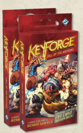
2 Unique KeyForge Archon Decks

Rules page 3 Glossary page 9 Fiction and Setting Information page 13