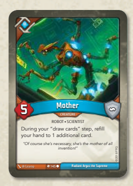
The game text on Mother is an example of a constant ability.