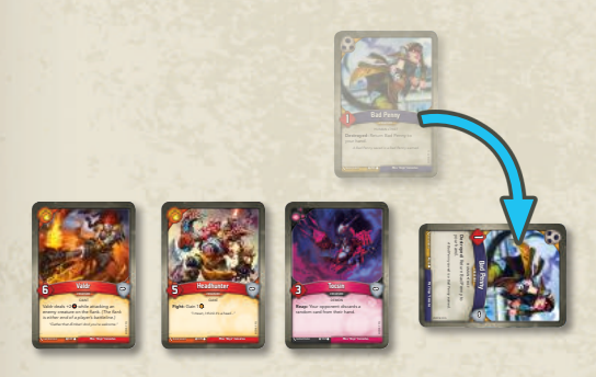
Creatures enter play on the flank