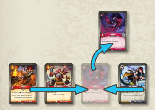
If a creature leaves play, the battleline is shifted inward.