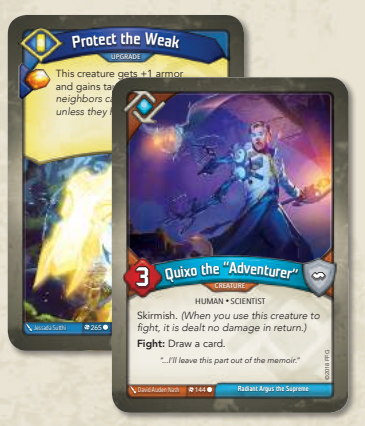
The Protect the Weak upgrade is attached to the creature, Quixo the "Adventurer."